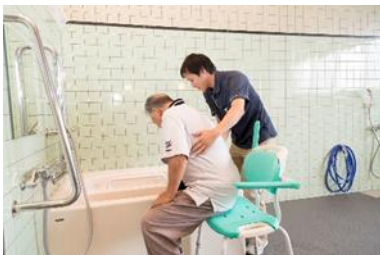
Assistance with bathing

The acquisition of certification is to prove their high knowledge and technique, which has advantage for getting stable jobs.