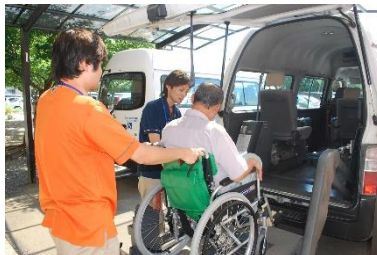
Assistance with getting in a car